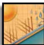
UV treated fabric