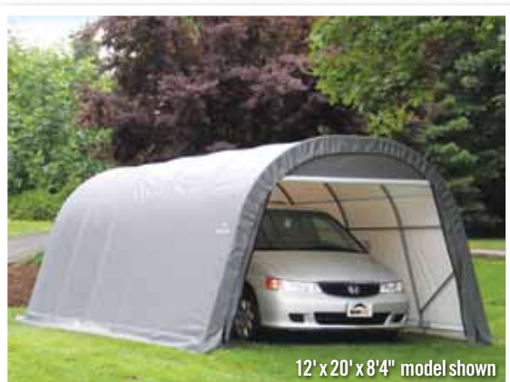
12' x 20' x 8'4" model shown