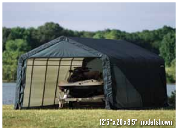
12'5" x 20' x 8'5" model shown