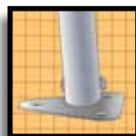
Steel foot plates

Actual frame dimensions are 12 ft. 5 in. W x 28 ft. L x 8 ft. 5 in. H